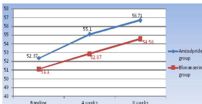
[Table/Fig-4]: Weight changes among the study subjects

(p < 0.0001) increase in BMI, with both the drugs, but there was no difference in the change seen between the two drugs.